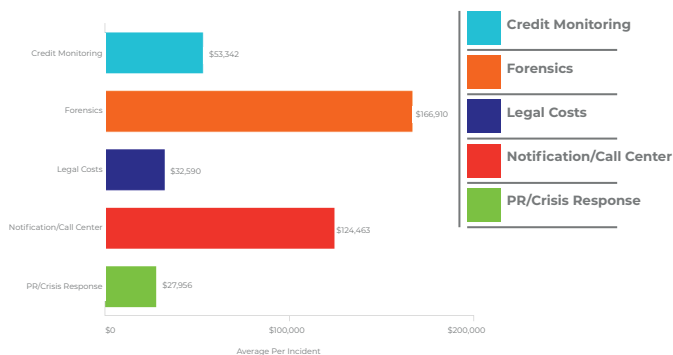
Average Paid Incident Response Costs Since 2009 Global and All Industries and All Dates

*This chart does not react to filters and the current year is a projection based on year-to-date claims as of the most recent update.